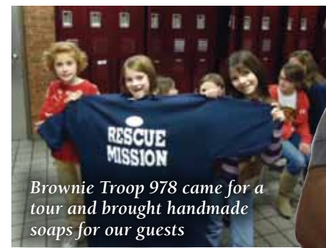
Brownie Troop 978 came for a tour and brought handmade soaps for our guests