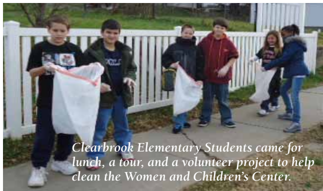
Clearbrook Elementary Students came for lunch, a tour, and a volunteer project to help clean the Women and Children's Center.