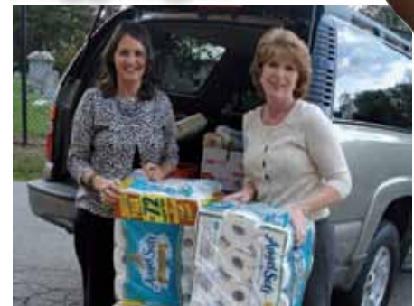
Lewis Gale employees provided much needed paper product supplies for our shelters.