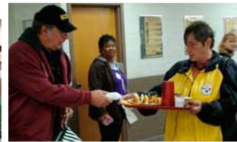
3 Ruritan Clubs (Bonsack/Blue Ridge, Catawba Valley, & Eagle Rock) joined forces to donate $200 in Kroger gift cards and 400 pairs of socks.