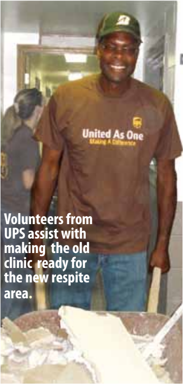
Volunteers from UPS assist with making the old clinic ready for the new respite area.