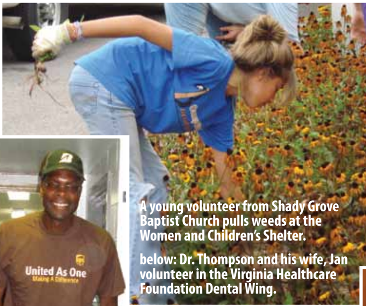
A young volunteer from Shady Grove Baptist Church pulls weeds at the Women and Children's Shelter.