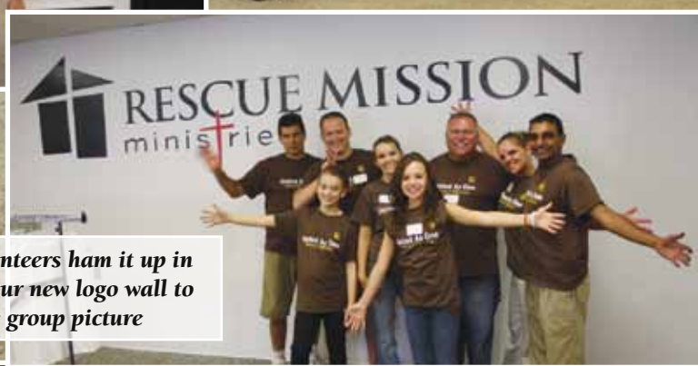
UPS volunteers ham it up in front of our new logo wall to take group picture