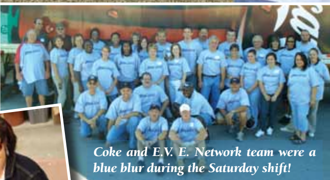
Coke and E.V.E. Network team were a blue blur during the Saturday shift!