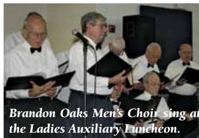
Brandon Oaks Men's Choir sing at the Ladies Auxiliary Luncheon.