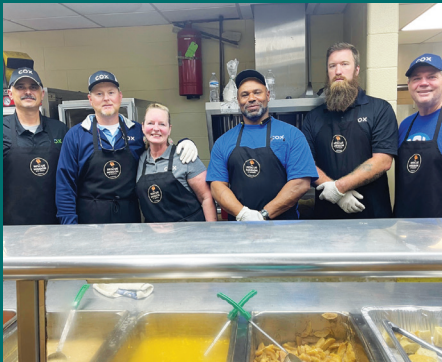
Cox Communications served lunch