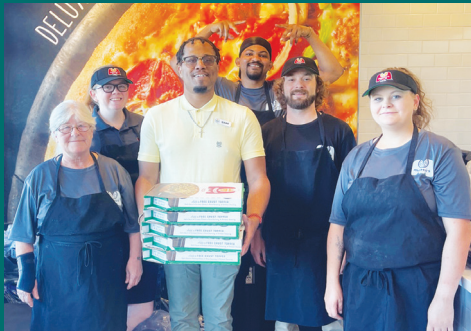
Marco's Pizza donated fresh out the oven cheese pizzas