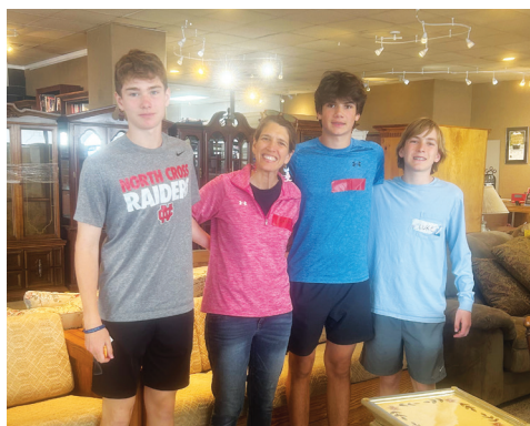
Second Presbyterian Church