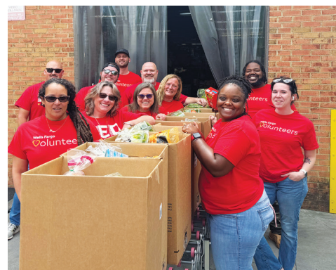
Wells Fargo Veterans